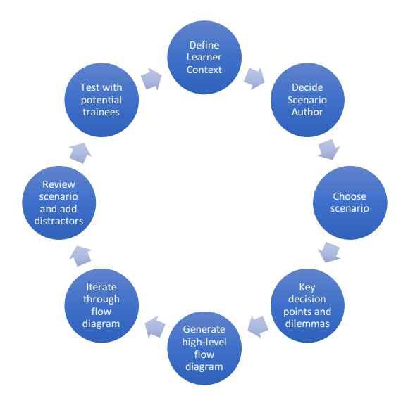
Figure 1: Iterative Scenario-based e-learning Design Process

The framework we have used for the process of design is similar to the process used by others such as Huffman [9], but is defined in more detail due to the nature of the requirements being solved here. It is also important to recognise that this is an iterative process, as with all learning materials there is always the need to update, revise and sometimes repurpose. The key steps in the design and implementation are articulated in diagrammatic form in Figure 1 below, and then described in more detail: