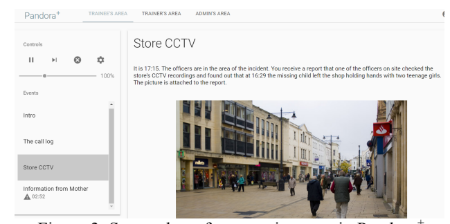
Figure 3. Screenshot of a scenario event in Pandora<sup>+</sup>

With regard to the scenario event description document, this contains a table of rows, where each row provides the details for one event and must include all the information required for an event to be entered into the Pandora<sup>+</sup> system. This includes the roles from which messages are sent from and to in a scenario, the content of the event, clearly labelling which items will be narrative, video, images, a question which doesn't branch the scenario, a question which does branch the scenario etc. Figure 3 provides a screenshot of the Pandora<sup>+</sup> system running the scenario, and Figure 4, at the end of the paper, provides an example of some table entries.