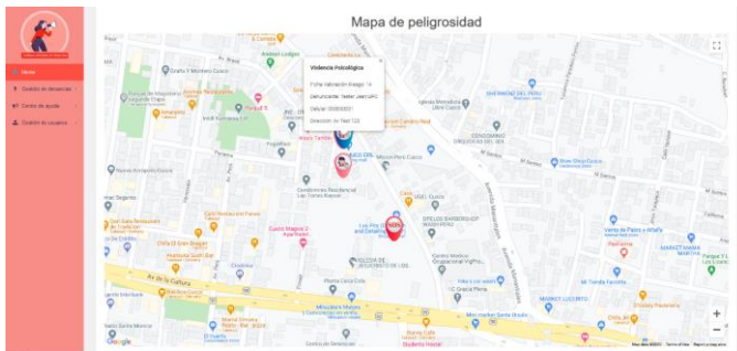
Fig. 4 Hazard map of the web application

It is an application developed with VueJs that allows members of the police, family court and Women's Emergency Center to deal with complaints about gender violence according to the scope of their organization. In addition, a danger map is presented, which facilitates the visualization of the complaints reported through the mobile application and the femicide alerts generated with the device [8]. On the other hand, the information shown in the mobile application is managed from the web by the members of the Women's Emergency Center, guaranteeing that the information is accurate and updated. In Fig. 4 the hazard map implemented in the web application is displayed, which shows the location of the registered complaints.